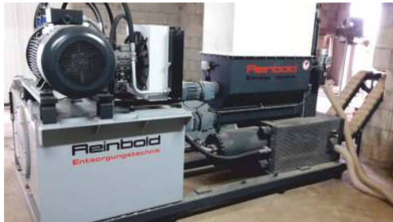
RB 600 RS in silo execution