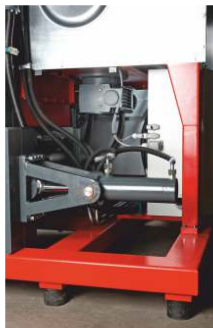
Powerful hydraulic cylinders, gear motors for the agitator and screw conveyor