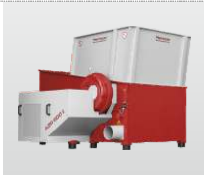
Series AZR 800 - AZR 2000 Gigant: The single shaft shredder for professional compaction of recyclables