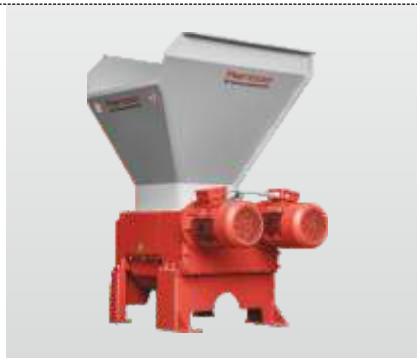
Series RMZ 500 - RMZ 1000 S: The four-shaft shredder that is ideal for shredding long stock