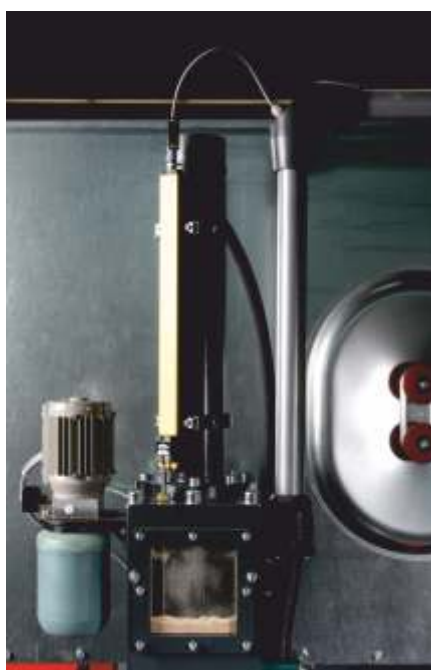
Position sensor for controlling the operations of the cylinder and the form. In addition, the central lubrication system