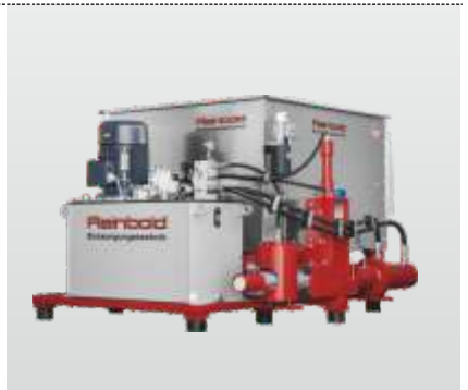
Series RB 100 - RB 300 Flexible S: For briquetting chips and dust

Drawing on its many years of experience, Reinbold, with its broad range of machines, is able to offer ideal solutions for different applications in material shredding and briquetting. Our testing facility is available to perform tests on your material.