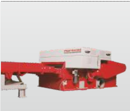
Series RHZ 300 - RHZ 1300 S: The horizontal shredder with horizontal material feed