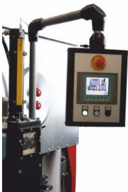
Control panel for control and programming of the briquetting press with touch screen