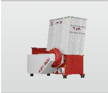
Series AZR 600: The universal single shaft shredder for woodworking shops