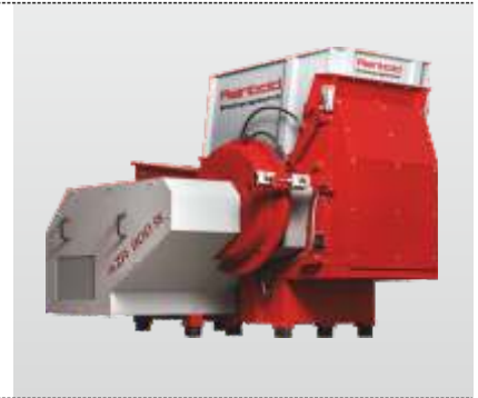
Series AZR 600 K - 2000 K Gigant: The single shaft shredder for effective plastics shredding